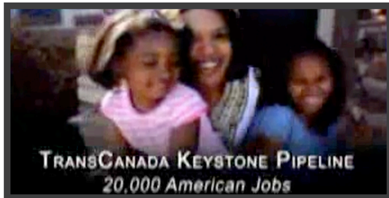
TransCanada's TV ads claim the pipeline will create 20,000 American jobs, but State Department estimates don't match up.

TransCanada, however, has been touting its own analysis that purports to show that job creation would be 13 times higher than State Department estimates, and more than 20 times higher than the State Department's best case estimates for Oklahoma and Texas. The company also makes the rather remarkable claim that almost 30,000 year-long positions would be created in states outside the pipeline's route. 45