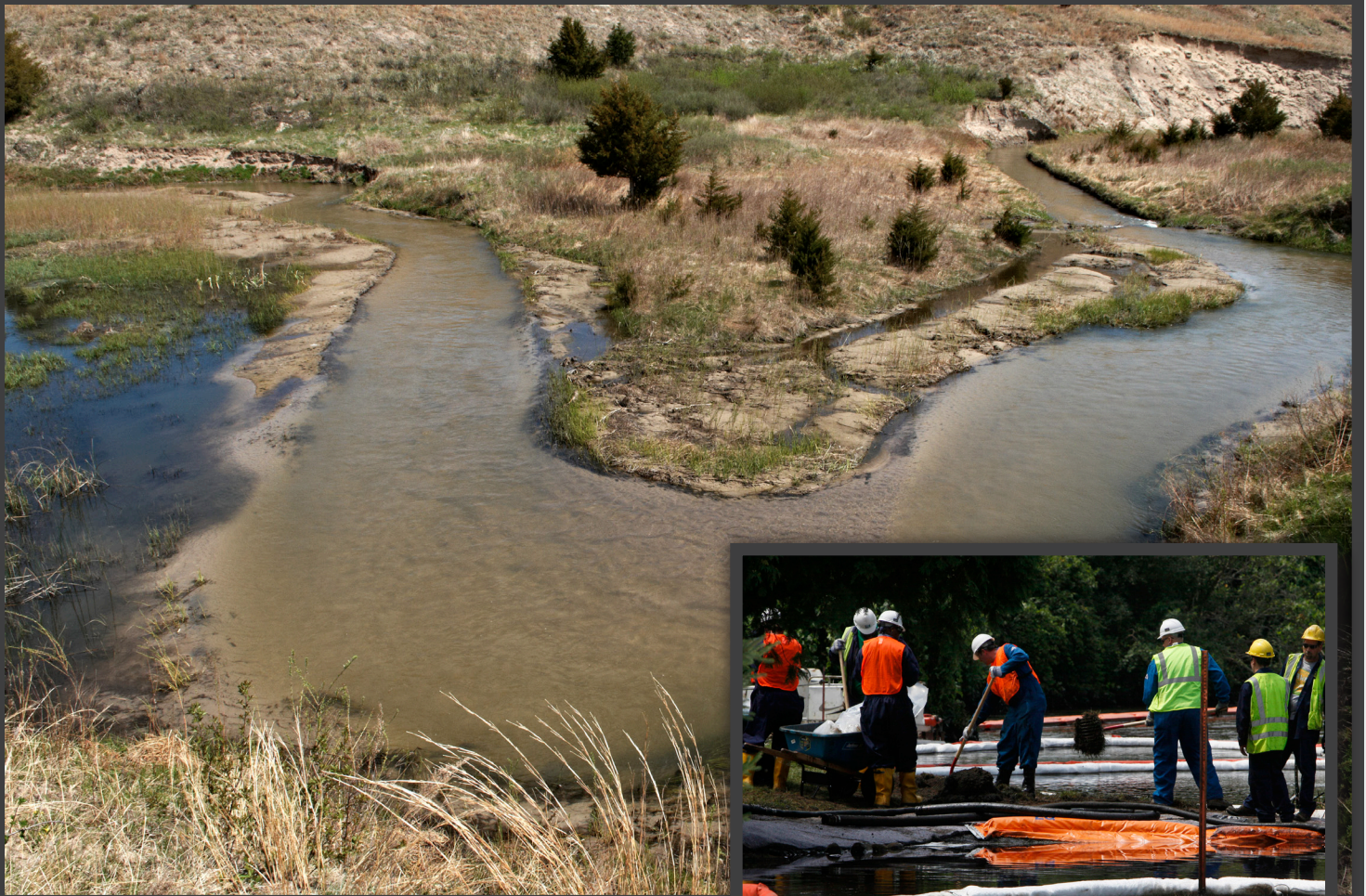
The sandy soil of the Nebraska Sandhills makes the region especially vulnerable to spills, which could seep through the porous ground and enter the Ogallala Aquifer.