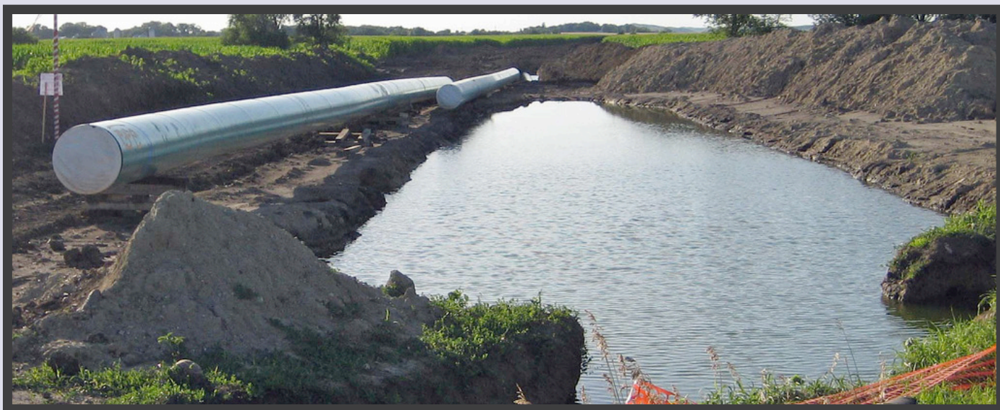
Keystone I pipeline under construction in South Dakota.