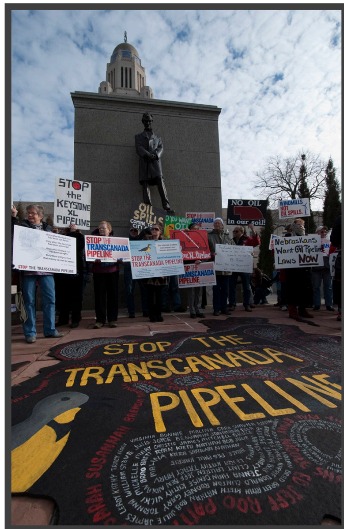
Nebraskan are fighting back against the Keystone XL pipeline.

The destructive nature of tar sands oil is one cause of this growing concern. After all, doubling reliance on the dirtiest and most expensive form of oil is a step backward for a nation wishing to move to a new energy future. But TransCanada itself has helped stoke the controversy through its behavior. The company has developed the reputation of a bully and bamboozler, intimidating farmers with legal threats, selling its pipeline to the public with exaggerated claims of jobs,