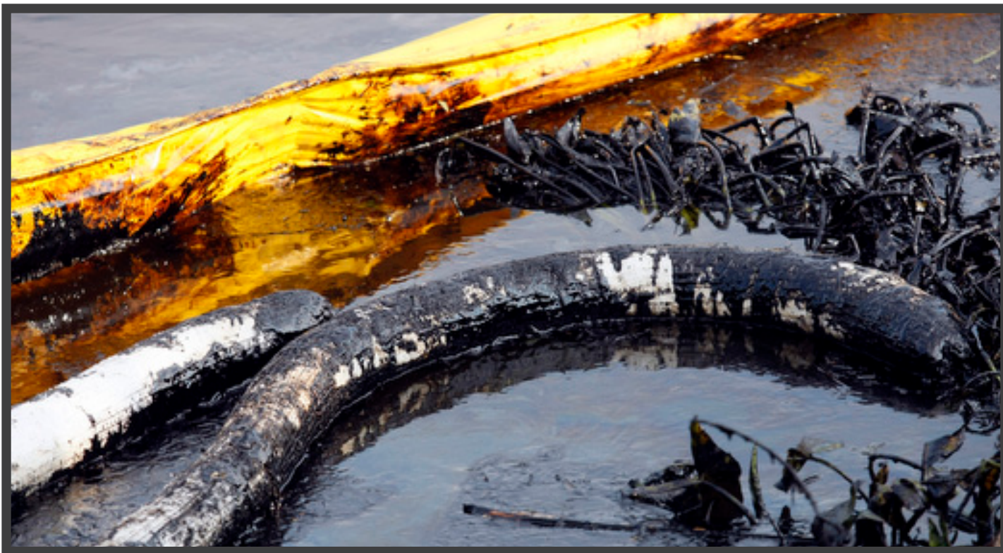
Following the tar sands oil pipeline spill in the Kalamazoo River, crews had to race to keep the oil from reaching Lake Michigan.

temperatures and pressures than conventional crude oil pipelines.