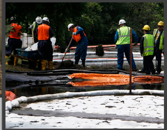
Right: On July 6, 2010, a tar sands oil pipeline in Marshall, Michigan spilled about a million gallons of tar sands oil into the Kalamazoo River. Nearly a year later, the river is still closed to the public.